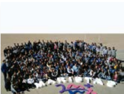
Spain: Meeting of Marist Youth 200+, in Salamanca