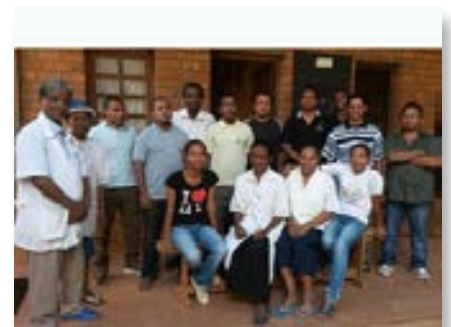
Madagascar: Teachers of the Lycée privé St Vincent de Paul, Betroka