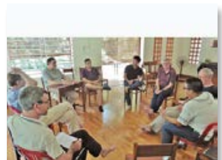
Meeting in Vietnam

Thinking about the youth, he affirmed that “the new beginning the Congregation speaks about can and must begin for youth. This mystic should move us towards encountering others.” During the encounter, the youths were presented with a new propos-