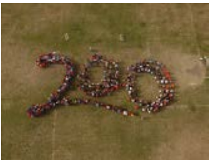
Uruguay: Maristas San Luis, Pando