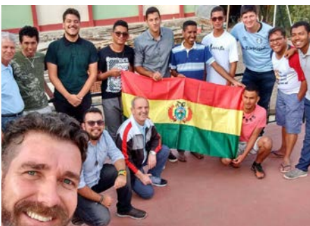
Bolivia Marist Novitiate of Cochabamba