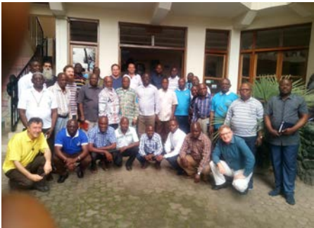
Rwanda: Sustainability Project for Africa and Asia, II Workshop, in Gisenyi