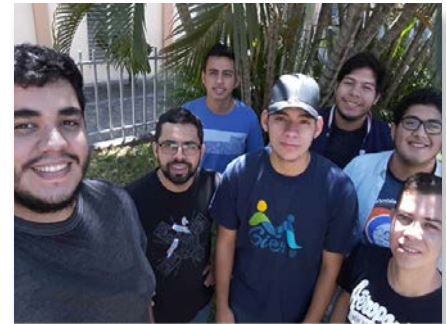
El Salvador Marist candidates in Mejicanos