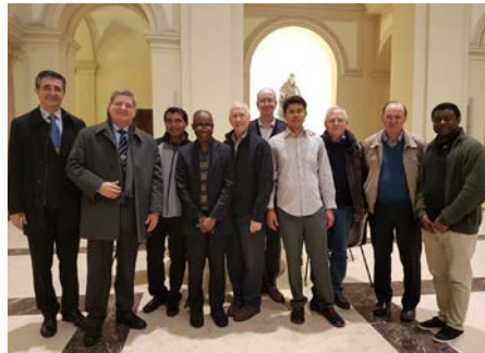
Italy Gregorian University