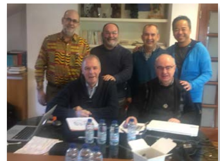
Portugal: European Brothers Today Commission, Lisbon