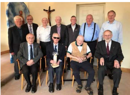
Ireland: Jubilees of religious life in the Marian College