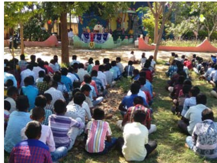
India: Saint Marcellin Higher Secondary School - Mangamanuthu