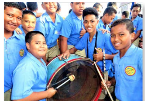
Fiji Marist Brothers Primary School Mulivai