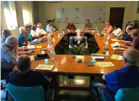
General House: Meeting of actual and previous General Council