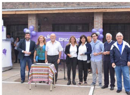
Argentina: Escuela Marcelino Champagnat, Rosario - 25 years