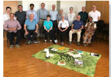
Italy: Meeting of the general councils of the four Marist branches, in Nemi