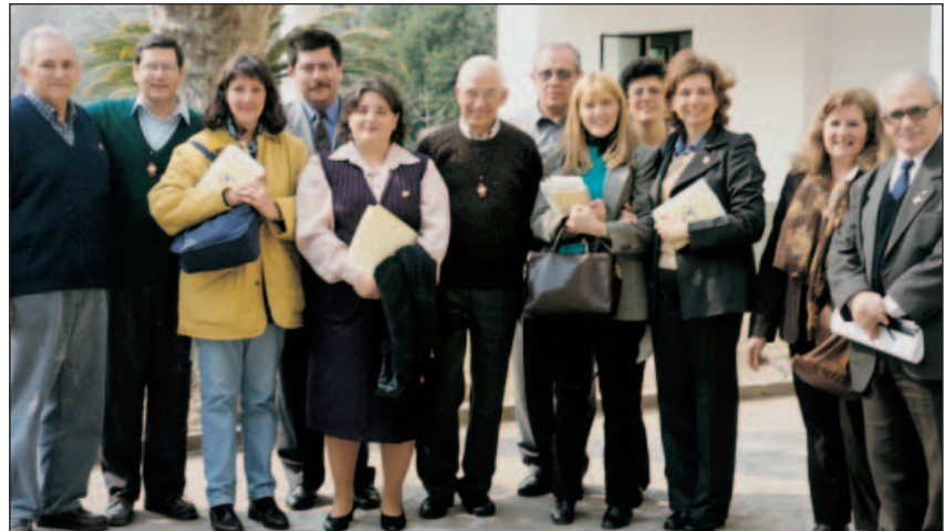
The new “San Marcellino” Fraternity at Colegio San José de Morón in Argentina.

“The canonization is a grace-filled time for rediscovering Marcellin. A time to see ourselves reflected in the mirror of his virtues, to fall in step with him in his travels with Jesus. A precious time to be together and grasp his basic aims; to claim once more, together, the refreshing spirit and zeal of that first community alongside the River Gier; to listen attentively to the beating of Marcellin’s compassionate heart meeting new