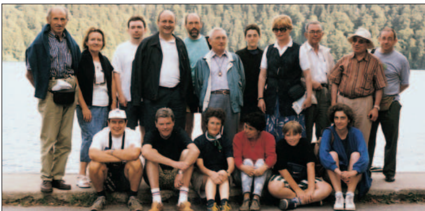
Members of various fraternities from France in Tauves.

Before concluding let me say that from here in Cuba, I am speaking on behalf of many former Marist students in asking for prayers for the Marist Brothers and the Champagnat Movement, that God keep blessing their work, in itself but a grain of sand, but with His help, contributing greatly to “the construction of the civilization of love” to which we are all being called by John Paul II. ♦