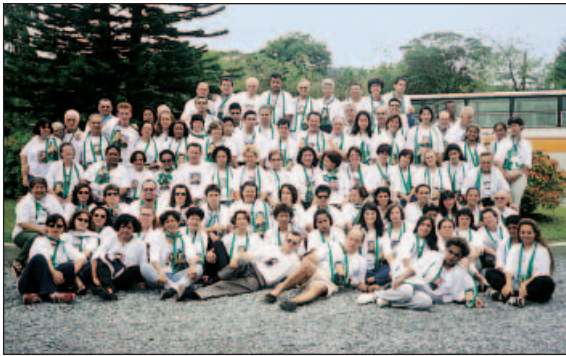
Third Encounter of Fraternities, held in Rio de Janeiro, Brazil.

Lay people who gather to share in our spirituality and mission with St. Marcellin. They organize informal groups, called Marist Fraternities. They choose a life plan that will affect the Christian, family, and professional dimensions of their lives.