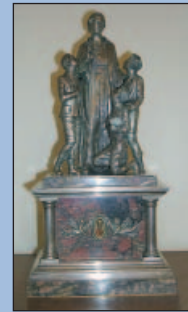
Reliquary given by the Marist Brothers to Pope Pius XII at the Beatification, 1955.