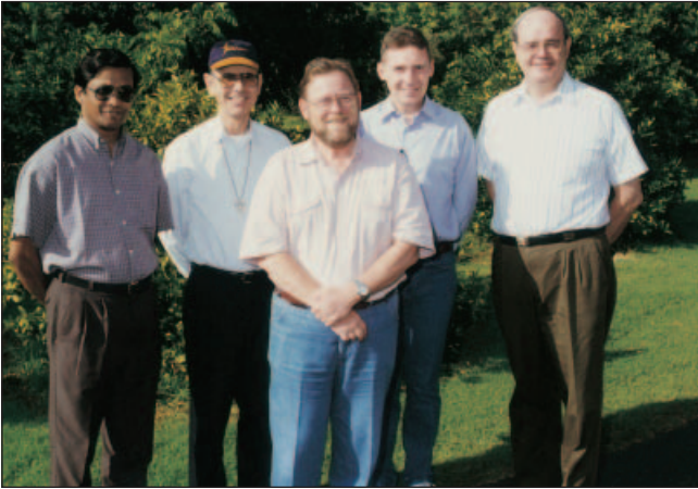
Visit to the Province of Sydney, Australia.