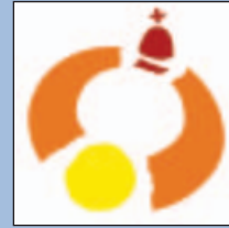
Logo of the XV World Youth Days