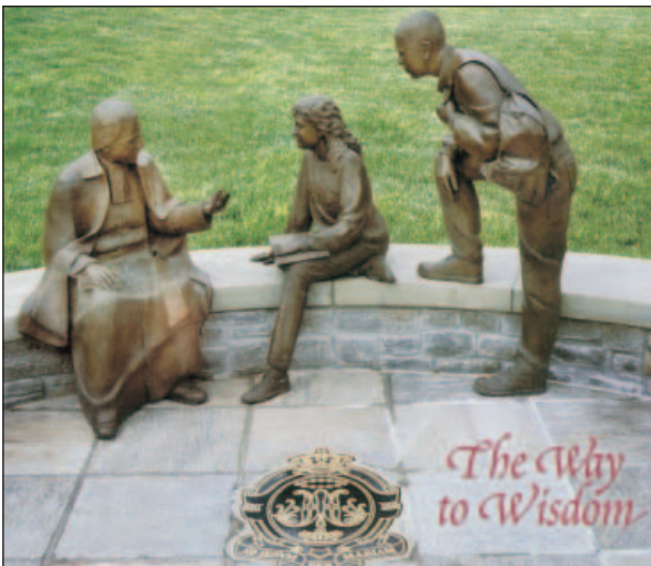
Sculpture of St. Marcellin Champagnat at Marist College in Poughkeepsie, New York, USA.

Time passed, and as his earthly life was ending, so many of his important dreams had come true. Marcellin had set out on the road of life on May 20, 1789. He accomplished unimaginable things! On June 6, 1840, on heaven's doorstep, he found himself surrounded by a great family of Brothers and countless children who had learned to love Jesus and Mary and gradually become good Christians and good citizens. Well could Marcellin smile on those ideals that he had had as a youth: "I will sell many lambs, I will be rich, and then..." No doubt about it – God's ways turned out to be best! ♦