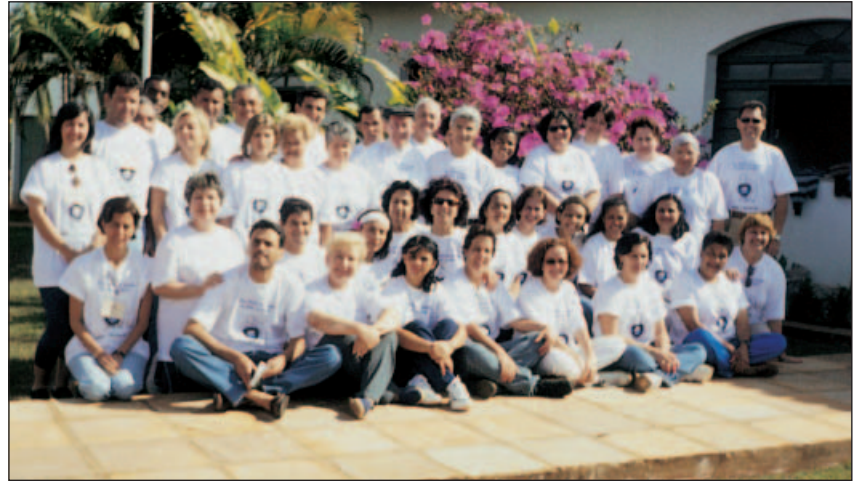
Meeting of Fraternities from the Province of Rio de Janeiro in Uberaba, Brazil. August 2000.

“My hectic social schedule led me to feel the necessity of “anchoring” myself in a religious family. People suggested I look into Marist Fraternities as a way of grounding my activity and filling it with genuine meaning. In order to live my faith in Christ in all its fullness, I needed to return to the fountains of life. In Mary, I have found someone serving, welcoming, ready to assist her neighbors in all their needs, the very way of living the Gospel that I was looking for.”