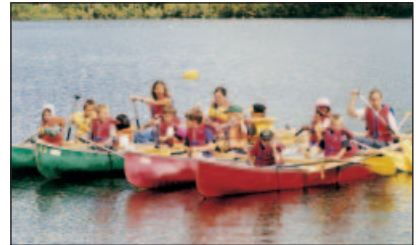
On Lake Morgan

Over the years, developments in the field of pastoral care set the tone for changes at the Camp. Pre-