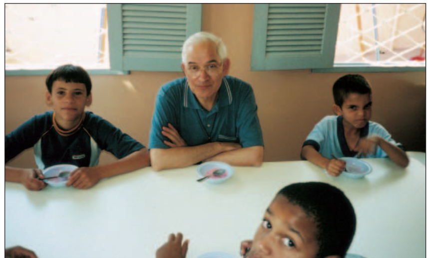
At the Marist Home for children in Belo Horizonte, Brazil

will take to heart the Chapter's message and our readiness to live our vocation with joy and enthusiasm, open to the world of children and young people. The Preparatory Commission has proposed this slogan for us: "Choose Life". It's up to us to give this saying form and content. We are to choose life, but what life, and for whom? A life closed in on ourselves as brothers? We cannot lose sight of the fact that we are choosing life for the youth of today, especially those in great need. I want us to choose – firmly and unambiguously – to work on developing communities of LIFE that will journey with the young and our lay associates toward the heart and soul of our faith: Jesus Christ. ♦