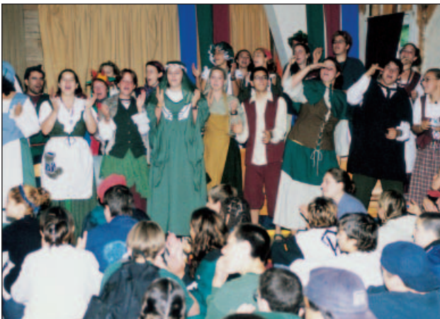
Counselors and campers dressed up for Mass

Pastoral care was a predominant feature of life at the Camp, its reason for existing, deeply ingrained in the hearts of its counselors and seen in their dedicated efforts. At first, it was manifested simply by the presence of the Brothers and the availability of daily Mass, in line with the religious atmosphere of the times, awakening in our campers the presence of God in the midst of the Camp’s beautiful natural surroundings.