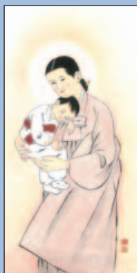
A Korean image

The Province of Beaucamps Saint Genis, for its part, organized a Provincial Assembly with the theme: "Marist mission in partnership with the laity."