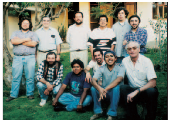
With the Novices in Cochabamba, Bolivia

The more the wellsprings of a spirituality become known, the more secure and deep-rooted is that spirituality's foundation. Choosing to live one's life as a Marist means making a concerted effort to live according to Saint Marcellin's intentions and intuitions in the world of today, with both feet planted firmly on the ground. It means pursuing reality, our only theological place, i.e., our only window of opportunity to meet God in the happenings of our everyday lives. ♦