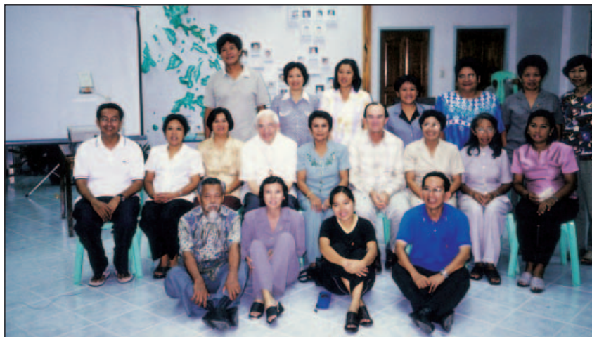
VI National Meeting of Fraternities in Mexico, November 3-5, 2000