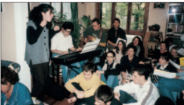
A meeting with young people