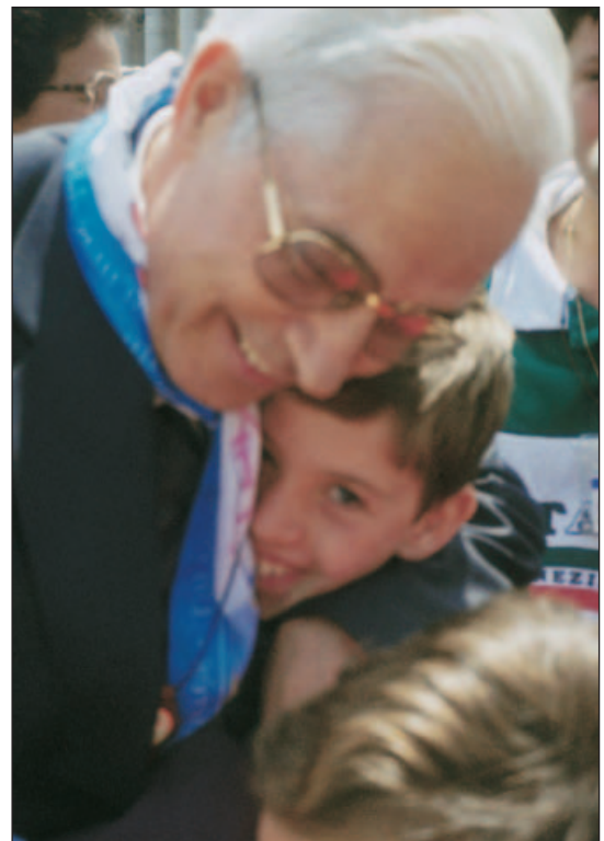
Being Marist means having great love for children and young people

Thinking and acting as Church, keeping in mind the pressing needs of the world and young people, is a sign of hope that will allow us to see our future as God does, and reinforce our reasons for continuing to be Marist, brother or lay person. ♦