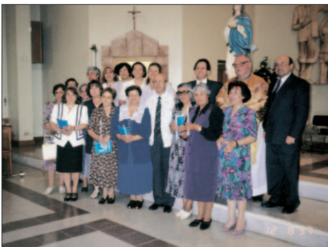
Fraternity Saint Marcellin Champagnat, in Rancagua, Chile