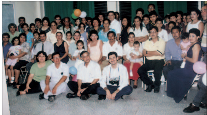
Fraternity Saint Michael, in El Salvador

Numerous, too, the Fraternities that have arisen in the Marist Province of Córdoba, Argentina: "Nuestra Señora del Camino" and "Gotitas de Miel," both in Jujuy, in the northern part of the country; "Divino Llamado" in the city of Rafaela; a new "San Marcelino" Fraternity in Pilar;