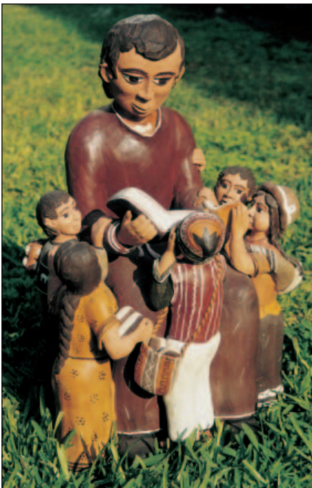
At the Provincial House in Lima, Peru.

It was the calling and charism of Marcellin to draw near to children and young people, attuned to their needs, understanding of their shortcomings, and quick to apply reasonable remedies – always helping them turn stumbling blocks into stepping stones to success. ♦