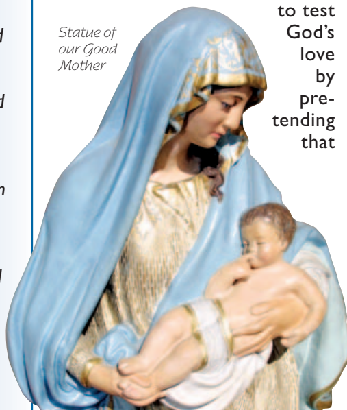
Statue of our Good Mother

This Christmas, then, why not keep these three points in mind: one, God's love is unconditional. That's right: spirituality has more to do with passion than with any pious practice. Two, getting involved with Jesus on his terms means imitating as well as admiring him. So, expect to pay a price for this relationship. And, three, the stable is still part of December 25 th . After all, a suffering servant, not a conquering king came to set us free. So, go and be likewise always giving first preference, as Marcellin did, to the poorest of young people in need of hearing some Good News. ♦