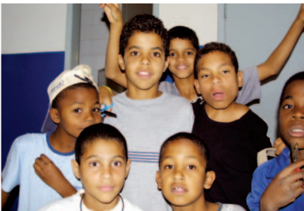
Eying a future filled with hope

Our aim is to meet the children's needs, develop their physical, emotional, spiritual and intellectual abilities, strengthen family ties, and encourage their involvement in the community. We want Lar Marista to reproduce a family atmosphere as faithfully as possible, with advice, affection, dialog, love, work, study, recreation, and duties and responsibilities. To achieve this, our teaching methods are based on a program of presence.