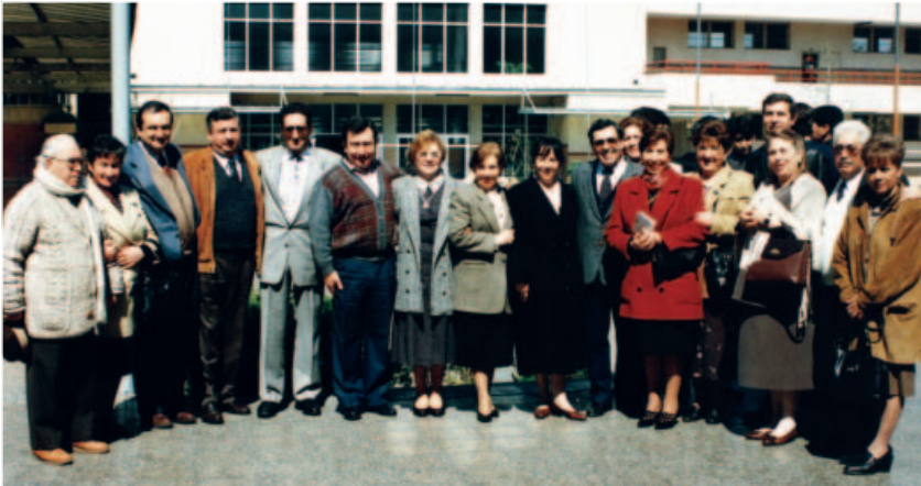
Fraternity of Our Lady of the Hermitage in Santiago, Chile (archive photo)

On the 9 th of November 1975 we established the Community of Our Lady of the Hermitage in honor of our Founder, Saint Marcellin Champagnat. He has guided our steps ever since, together with our Mother in Heaven.