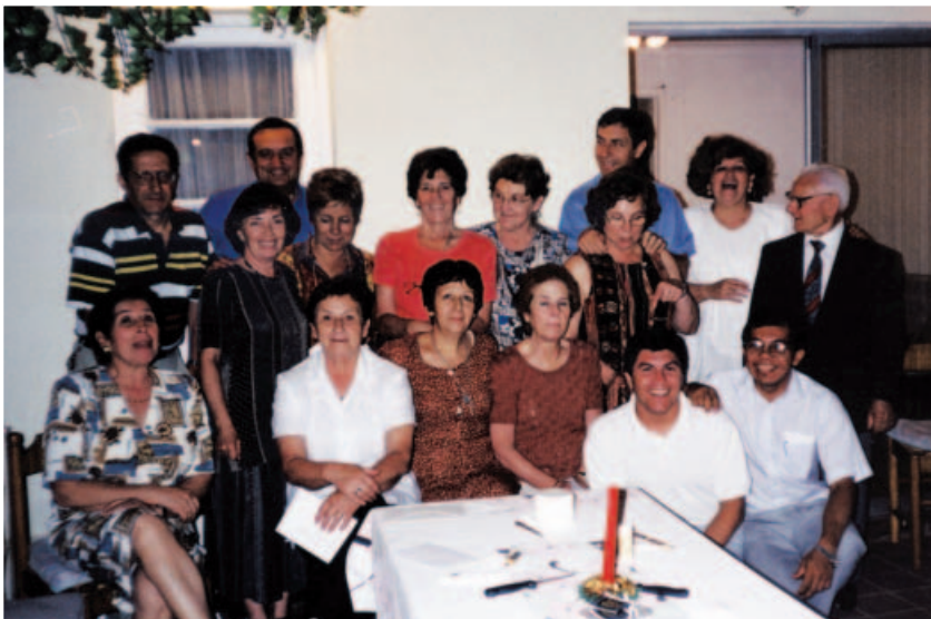
The only way is to travel the paths of the Lord together

The last General Chapter invites each and every one of us, Brothers and laity, to be other “Champagnats” today, in order to reinvigorate our strength and continue his dream of a community of brothers and sisters living like a family, sharing our joys and sorrows, our successes and failure, our life with Jesus and Mary to make them known and loved. Society today expects of us a concrete reflection of how Jesus would act, of His love for each and every person, without distinction or qualifying adjectives.