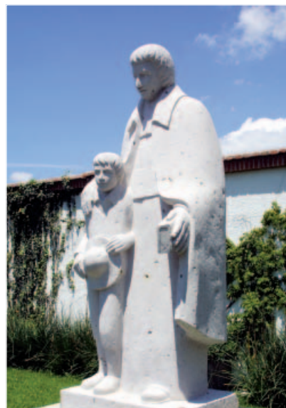
Statue of Saint Marcellin in Encarnación de Díaz, Jalisco, Mexico

The formation given by Father Champagnat to his Brothers was very well adapted to the conditions of the families in the rural areas of France. Since the children of the poor families were needed by their parents during summer to help them with farm work, they could only attend the classes given by the Brothers during winter. Therefore, the "Petit Frères" became teachers during the winter months. During summer, the Brothers had to go back to the Hermitage to work at various trades, including nail making, gardening, shoe making, weaving, and carpentry. Aside from being a place for this, the Hermitage also had a boarding school, an orphanage, and a home for the aged.